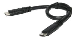
cable x1 Manual x1

As professional distributor of semiconductor, our business includes main NBPC and Cellular phone's manufacturer in the world wide. We provide strong support with multi-channel resource.