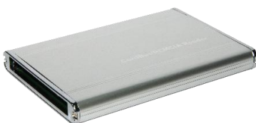
CardBus/PCMCIA Reader to ExpressCard 34x1